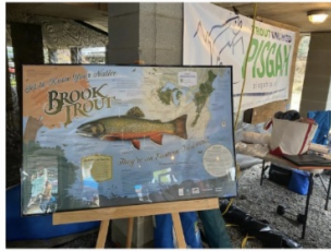
We engaged many people during the event about our conservation, education, and outreach programs.