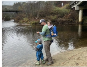
Families and kids were provided fishing instruction.