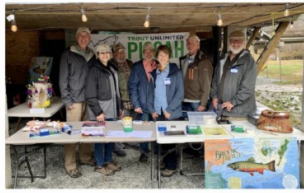
PCTU members hosted a booth to share information about our mission.